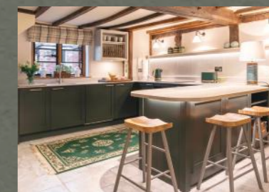
Further Examples of the Legacy Concept