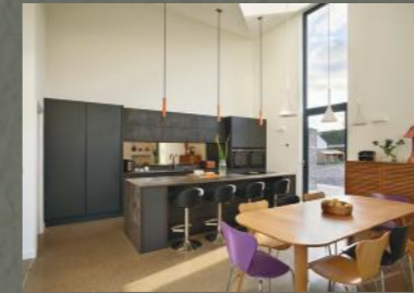
Further Examples of the Elemental Concept