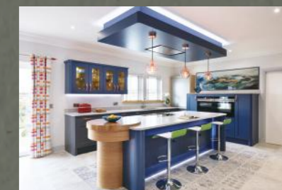
Further Examples of the Boutique Concept