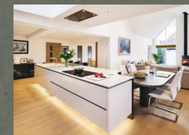
Further Examples of the Vision Concept