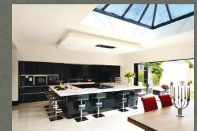
Further Examples of the Lifestyle Concept