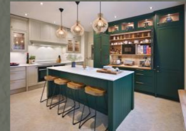
Further Examples of the Origins Concept